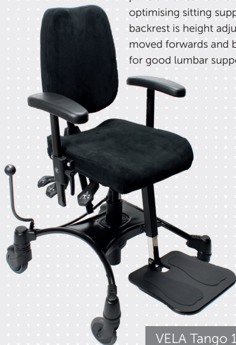
VELA Tango 100S

VELA Tango 100S is supplied as standard with a seat featuring a cavity with foam panels that can be reversed or changed, optimising sitting support for the child. The backrest is height adjustable and can be moved forwards and backwards and tilted for good lumbar support.