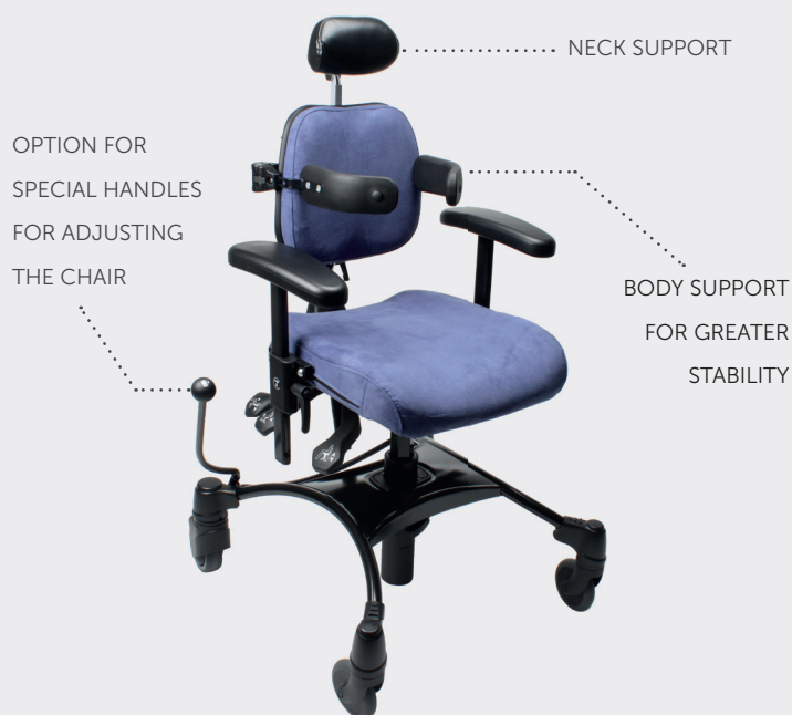
Examples of accessories for VELA Tango 100S

A complete list of accessories is available at www.vela.eu .