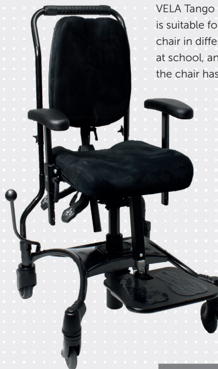
VELA Tango 100S

VELA Tango 100S with a push handle is suitable for children who use the chair in different places, for example at school, and require support when the chair has to be moved.